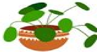
CHINESE MONEY PLANT