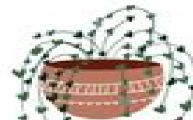
STRING OF HEARTS