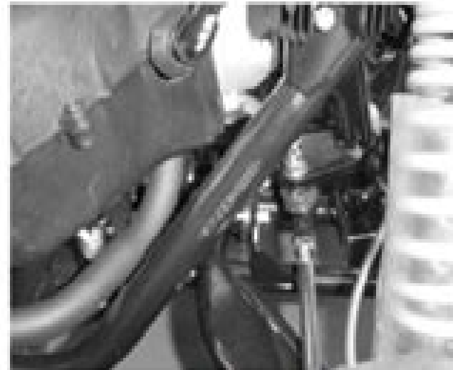
RXL / EXL150 (Viper. St)