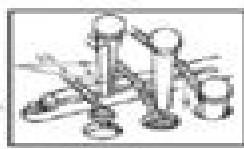
Bridge Stringing - Acoustic (Point about how the headstock)

The bridge end of the instrument is shown as shown in the image at left and right. Different recommendations are shown according to the bridge and string type. The bridge end of a string is always string before the string posts at the headstock.