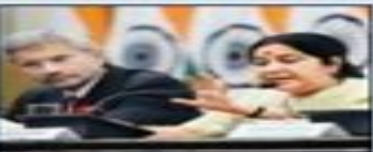
समर्थन से आए कई देश