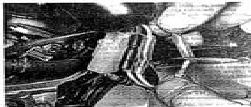
7.2 Disconnect generator lead wires to test ignition source and pulser coils