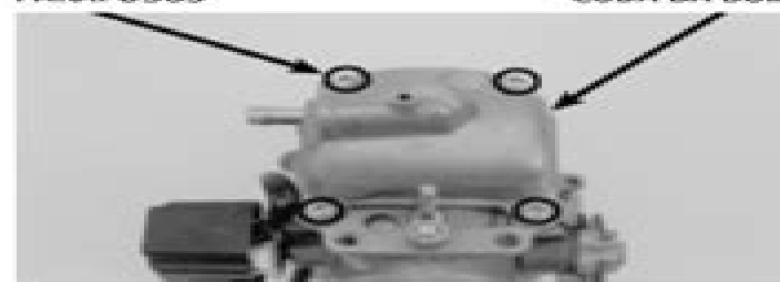
CUBA DA BÓIA