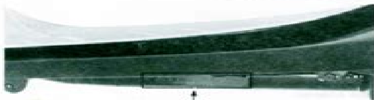
(1) FRAME SERIAL NUMBER

The frame serial number is stamped on the left side of the frame.