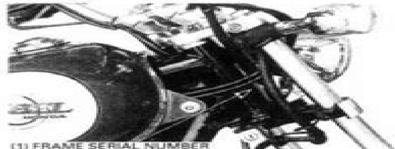
(1) FRAME SERIAL NUMBER

(1) The frame serial number is stamped on the right side of the steering head.