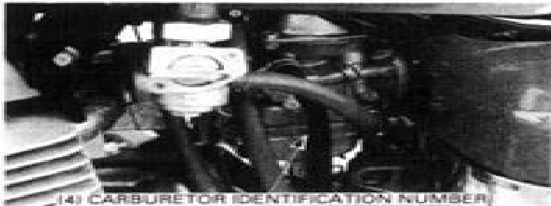
(4) CARBURETOR IDENTIFICATION NUMBER

(3) The engine serial number is stamped on the lower left side of the crankcase.