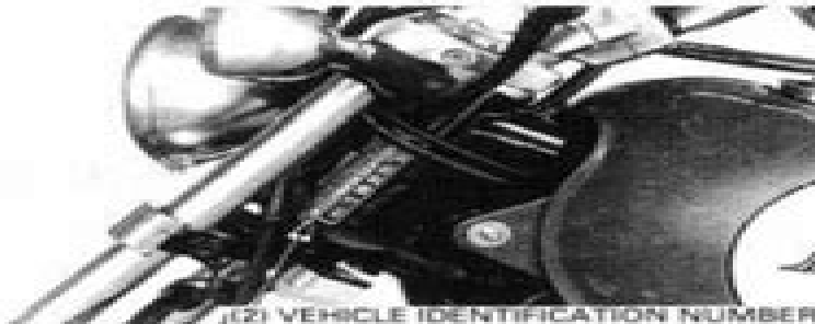
(2) VEHICLE IDENTIFICATION NUMBER

(1) The frame serial number is stamped on the right side of the steering head.