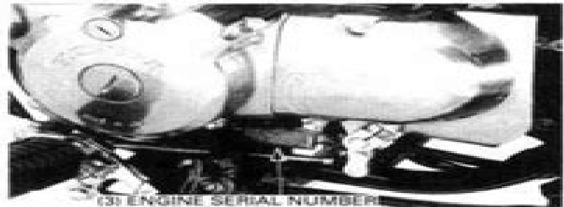
(3) ENGINE SERIAL NUMBER

(2) The vehicle identification number (VIN) is attached on the left side of the down tube as shown.