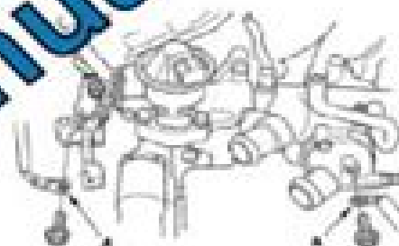
Fig. 24: Identifying Ground Cables

J35A6 and J35A7 engines: Remove the ground cables (A).