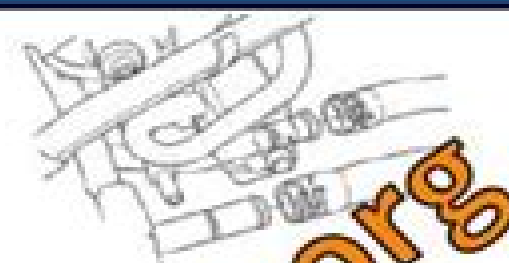
Fig. 23: Identifying Harness Hoses

Raise the voltage on the bolt to full bright. Connect the power steering pressure switch connector (A).