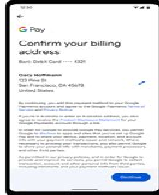
3. Confirm address and accept Google ToS