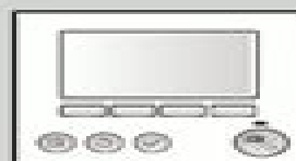
MAIN REMOTE CONTROLLER