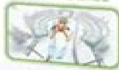
Customize Your Balance Games