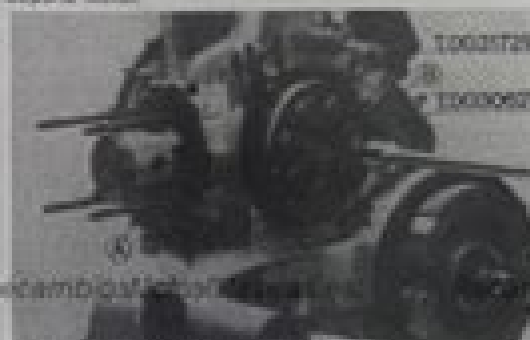
Desmontaje protón y grupo entrega.