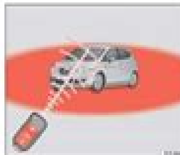
Fig. 44 Radio de acción del mando a distancia por radiofrecuencia

Con la tecla \Rightarrow Fig. 43 (Pantalla) del mando, se desbloquea el pánico de la llave.