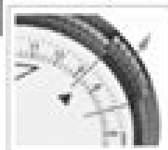
Fig. 27. Indstilling af tændingstidspunkter