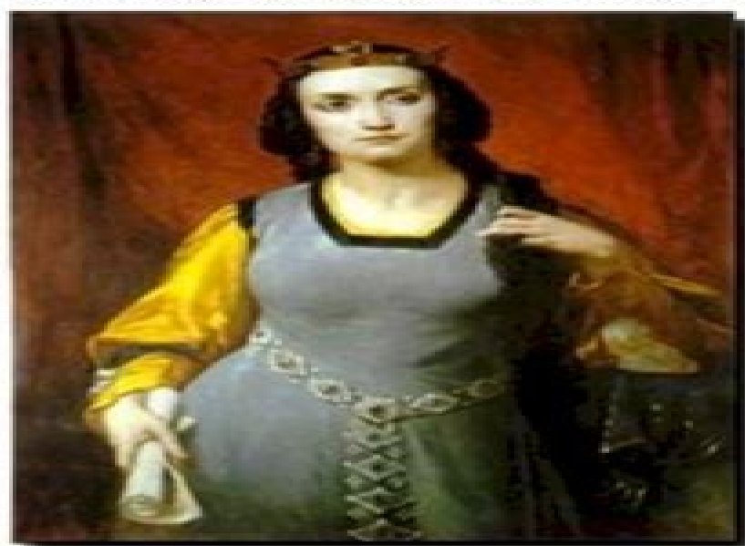
LA DERNIERE ANNEE DE MARIE DORVAL