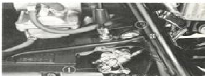
Fig. 3-2 ① Marks on control lever and oil pump ② Adjusting screw ③ Lock nut