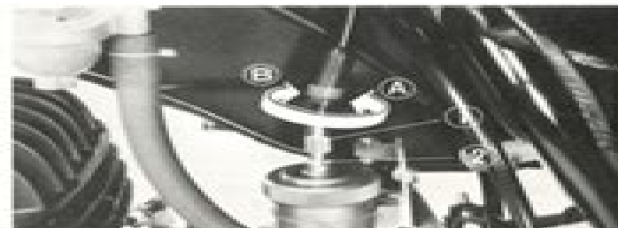
Fig. 3-3 ① Adjusting screw ② Lock nut