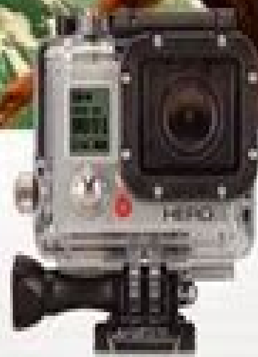
Silver Edition »