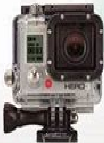
White Edition »