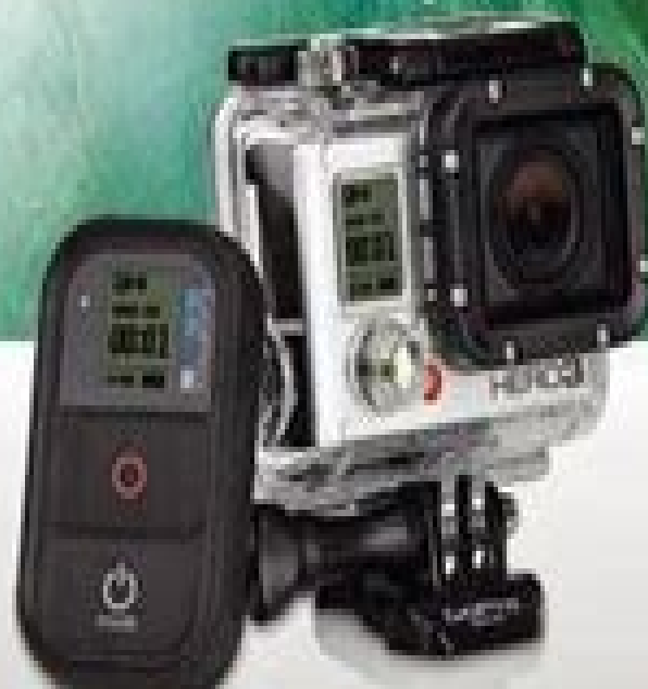
Black Edition »