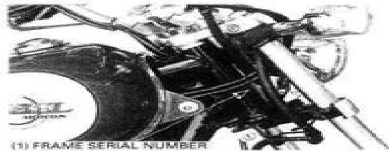
(1) FRAME SERIAL NUMBER

(1) The frame serial number is stamped on the right side of the steering head.