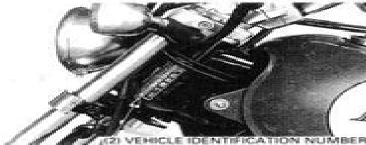
(2) VEHICLE IDENTIFICATION NUMBER

(1) The frame serial number is stamped on the right side of the steering head.