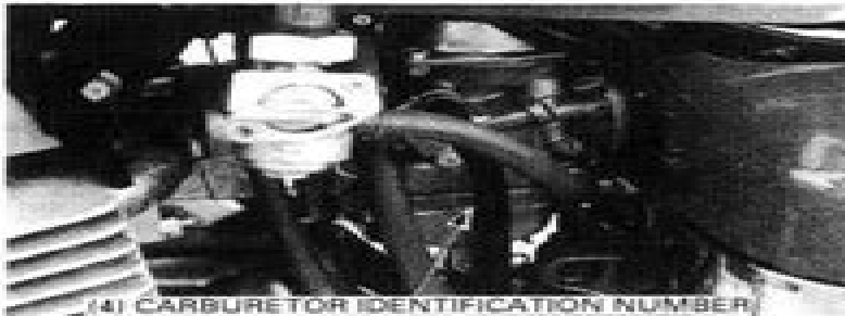
(4) CARBURETOR IDENTIFICATION NUMBER

(3) The engine serial number is stamped on the lower left side of the crankcase.