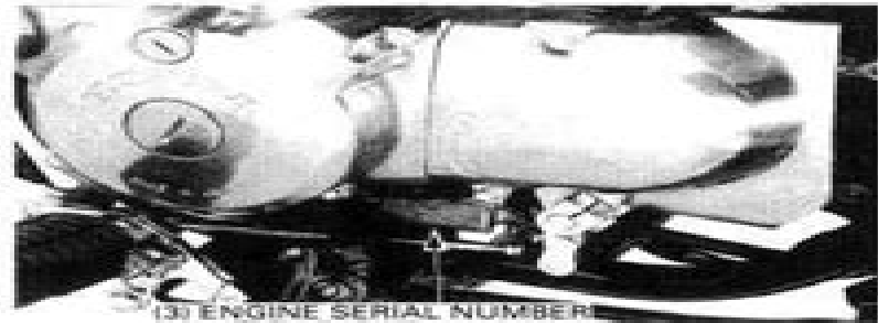
(3) ENGINE SERIAL NUMBER

(2) The vehicle identification number (VIN) is attached on the left side of the down tube as shown.