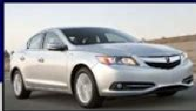
2013 ILX Hybrid