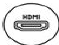
HDMI 1.4 *2