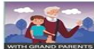
WITH GRAND PARENTS