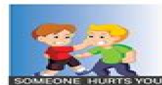
SOMEONE HURTS YOU