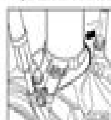
Diagram showing the removal of the motor.