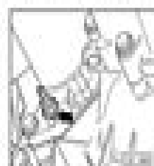
Diagram showing the removal of the motor.