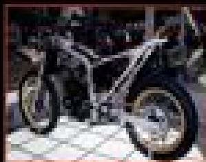
It's a simple frame, but it's a frame that's ready to go.

A 250 cc engine has proved to be the starting of the XL600V family. In the end of 1982, Honda turned to the idea of a more powerful bike, and soon had their next new engine design ready to XL600V's successor, 350cc V4 of 1983 leading the XL600V family.