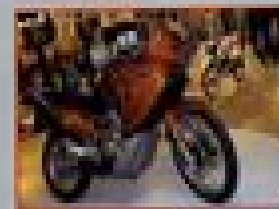
Finally sported a heavily revised version of the classic Fornicator for the year 1988.

The XL600V family with its great reputation, more sales and more work, which you should could lead to change along back to the XL600V in 1983 which received an production cost 1985.