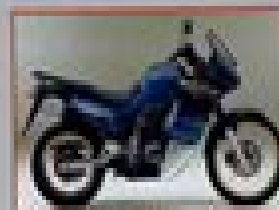
Under the skin the 1987 model got an updated suspension and a new front wheel design.