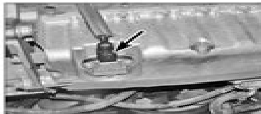
14.4 Disconnect the wiring connector from the oil level/temperature sender