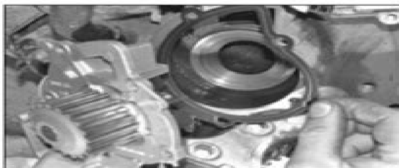
8.17 Renew the coolant pump gasket