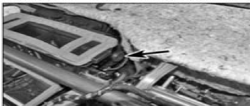
9.1 Even with the fascia removed access to the blower motor (arrowed) is limited

1 Ford suggest that the blower motor can be removed with the use of Ford special tool 412-131. This tool locks on to the fan and allows the complete fan assembly to be rotated with the fascia still in place (see illustration).