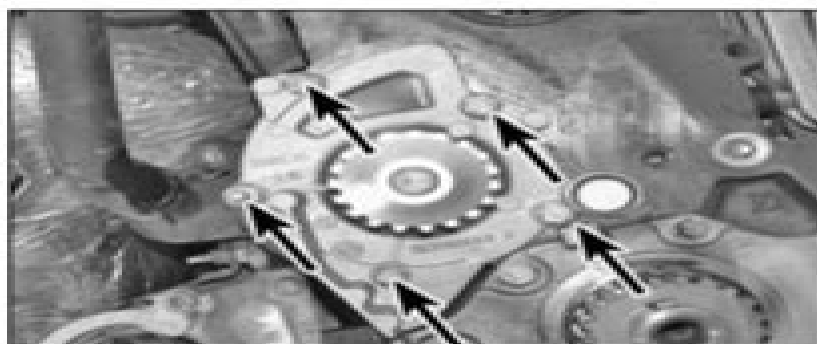
8.16 Undo the bolts (arrowed) and remove the coolant pump

16 Unscrew the bolts and remove the coolant pump pulley (see illustration).