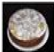
Österreichisch / Tirol (16)