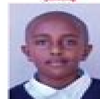
Wasla Paulos 95.9