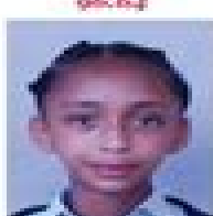
Bitaniga Yehuala 95.3