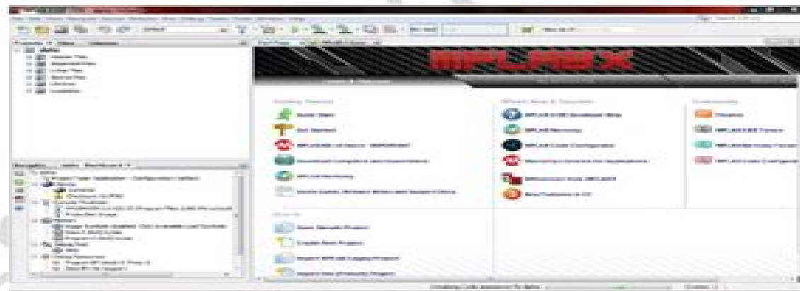
Figure 1.1 MP-Lab main screen

MP-lab is a Public domain software and is developed for the embedded applications on PIC and microcontroller and this is developed by multinational company named as Microchip technology. MP lab supports the coding, debugging and programming of microchips, microcontrollers of 8bit, 16bits and DS-PIC microcontroller and also for 32bit software asset management and Pic-Microcontrollers 32 bits.