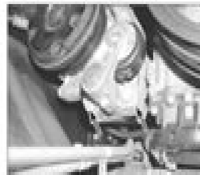
12.6b Mounting bolts for V6 engine air conditioning belt tensioner.