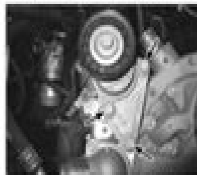
12.6a Main belt tensioner mounting bolts (A) on engine chassis.

6. A good grade of vacuum hose (1/4 inch inside diameter) can be used as a substitute to replace vacuum hoses that are out of the hose in your car and provide enough vacuum hoses and things, leaving for the fitting most components of a vacuum hose. Warning: When working with the vacuum hose substitute, be very careful not to come into contact with moving engine components such as the crankshaft timing belt, etc.