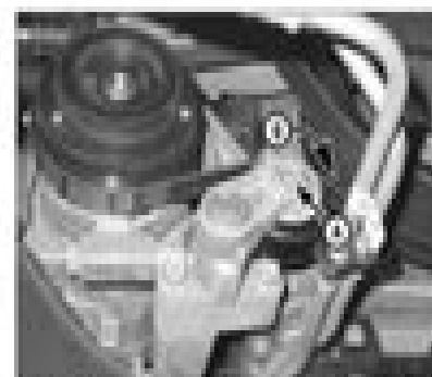
12.5a On V6 models with an air conditioning, the main belt tensioner is bolted around the belt (A) — use a 1/2 inch structure on the tensioner's support frame (B) to make it fit (B) for belt removal.

7. Route the new belt over the various pulleys, again moving the tensioner to allow the belt to be installed. Then release the belt tensioner.