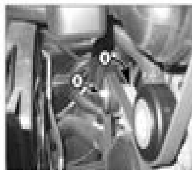
12.4b How a belt is bolted on the tensioner belt (A) and how the tensioner structure (B) is bolted around it.