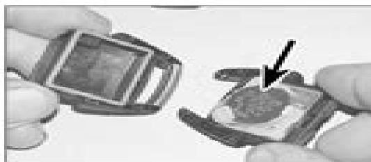
23.1b ... and remove the circular battery

Note: The brake and clutch hydraulic systems share a common reservoir.