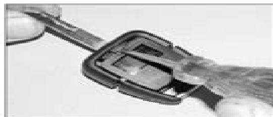
23.1a Prise off the battery cover ...