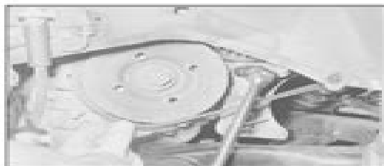
21.12 Turn the drivebelt tensioner backplate anti-clockwise and slip the belt off the pulleys – 2.0 and 2.2 litre engines