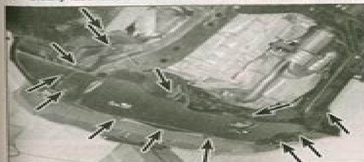
7.20 Location of the engine splash shield fasteners - some hidden from view