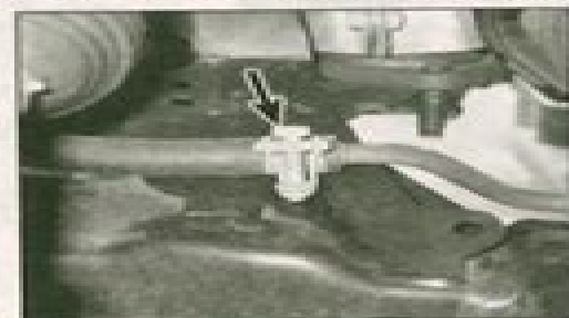
7.28a Disconnect the power steering return hose from the rear of the pipe on the right side of the subframe . . .