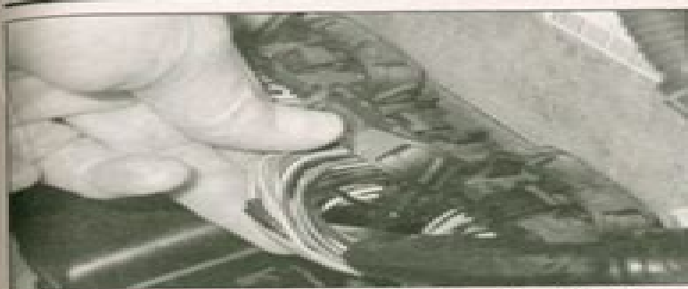
7.8 To disconnect the electrical connectors from the PCM, depress the button on top of the connector, swing the connector lock forward, then pull the connector out