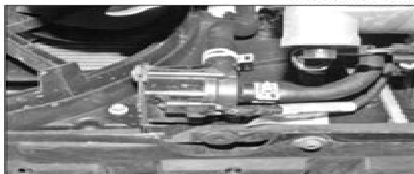
8.20 Disconnect wiring connector and hoses from the pump

been replaced the timing belt and tensioner should always be replaced. On completion refill the cooling system as described in Chapter 18 Section 28 and check for leaks.