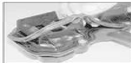
4.4 Fit the seal to the camshaft cover