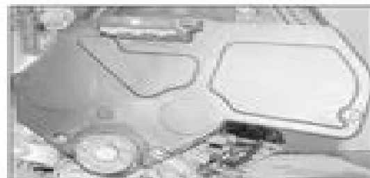
6.5 Timing belt lower cover bolts