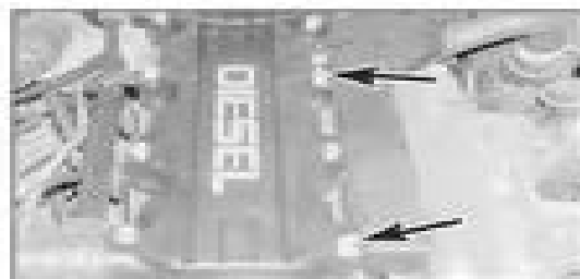
4.2 Disconnect the breather hoses from the front and rear of the camshaft cover