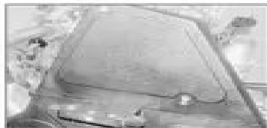
6.2 Timing belt upper cover bolts