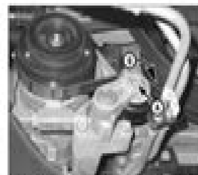
12.6c On V6 models with an air conditioning, the main belt tensioner is bent outward from below. Use a 1/4 inch drive bar in the tensioner's square hole (A) to rotate it (B) for belt removal.

7. Slide the new belt over the various pulleys, again moving the tensioner to allow the belt to be installed. Then release the belt tensioner.