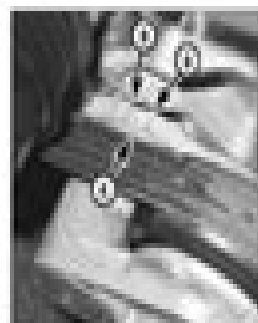
12.6a The tensioner for the air conditioning compressor (indicated) is similar to one. The mark (A) on the movable part of the tensioner must lie within the acceptable range mark (B).

6. Remove the belt from the tensioner and routing components are ready to install the tensioner.