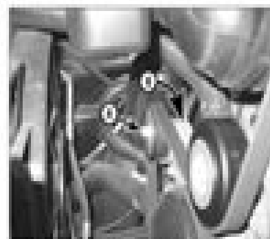
12.6b Place a thumb on the tensioner belt (A) and have the tensioner structure (B) be bent outward.