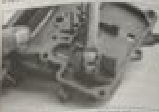
© 2006 The Authors Journal compilation © 2006 Blackwell Publishing Ltd