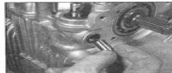
8.12b Recover the detent sleeve . . .

cover and the body of the joint. Pivot the lever against the bolt head directly beneath the end cover. Strike the other end of the lever with a few sharp hammer blows until the joint is released and moves out slightly (see illustration).