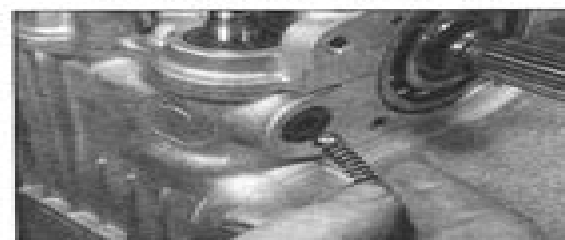
8.12c . . . spring and ball fitted behind the right-hand end cover on later models