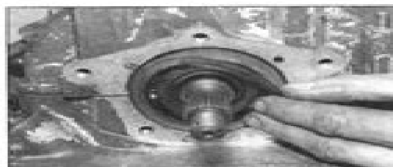
8.12a Recover the preload shim fitted behind the left-hand end cover