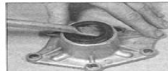
8.13 Levering out the end cover oil seal

If the problem persists it may be cured by fitting a nylon bush and O-ring seal, obtainable from your dealer, behind the main oil seal (see illustration). The bush will align the shaft centrally in the seal, making the seal more effective.