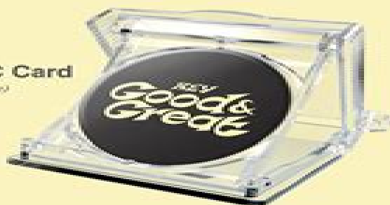
Music NFC Card 25.7 (mm)