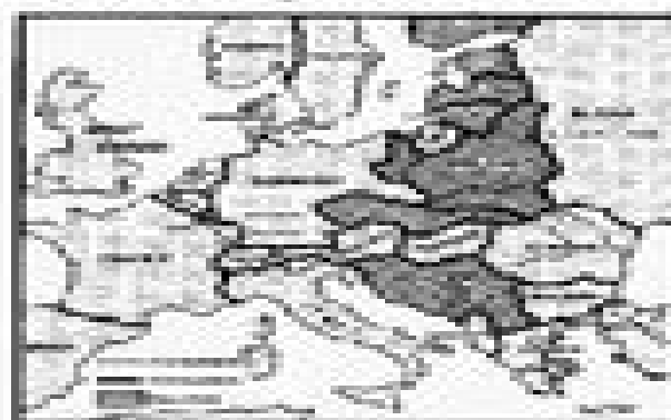
EUROPE AFTER WORLD WAR I