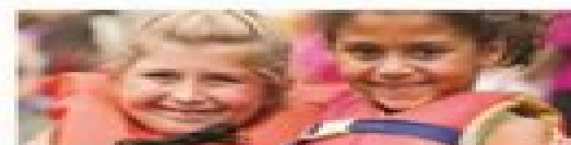
Developing Lifelong Friends

Girl Scouts of the Commonwealth of Virginia Offers Programming to Girls in K-12th Grade.