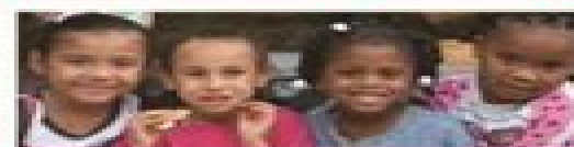
Experiencing Girl Scout Traditions