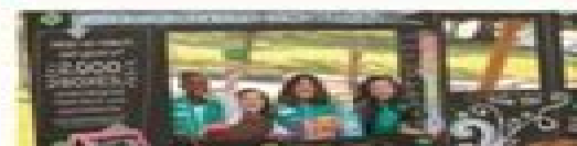
Learning Financial Literacy Skills

Girl Scouting builds girls of courage, confidence, and character, who make the world a better place.