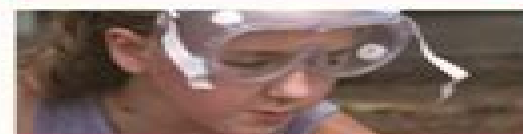
Exploring Science, Technology, Engineering, & Math