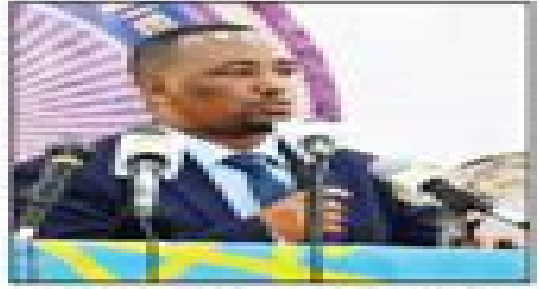
የደቡብ ሱዳን ታጣቂዎች በደቡብ ምዕራብ ኢትዮጵያ ክልል የወርቅ ማውጫ እካባቢን መቆጣጠራቸው ተሰማ፡፡

የደቡብ ሱዳን ታጣቂዎች በደቡብ ምዕራብ ኢትዮጵያ ክልል የወርቅ ማውጫ እካባቢን መቆጣጠራቸው ተሰማ፡፡ የደቡብ ሱዳን ታጣቂዎች በደቡብ ምዕራብ ኢትዮጵያ ክልል የወርቅ ማውጫ እካባቢን መቆጣጠራቸው ተሰማ፡፡ የደቡብ ሱዳን ታጣቂዎች በደቡብ ምዕራብ ኢትዮጵያ ክልል የወርቅ ማውጫ እካባቢን መቆጣጠራቸው ተሰማ፡፡