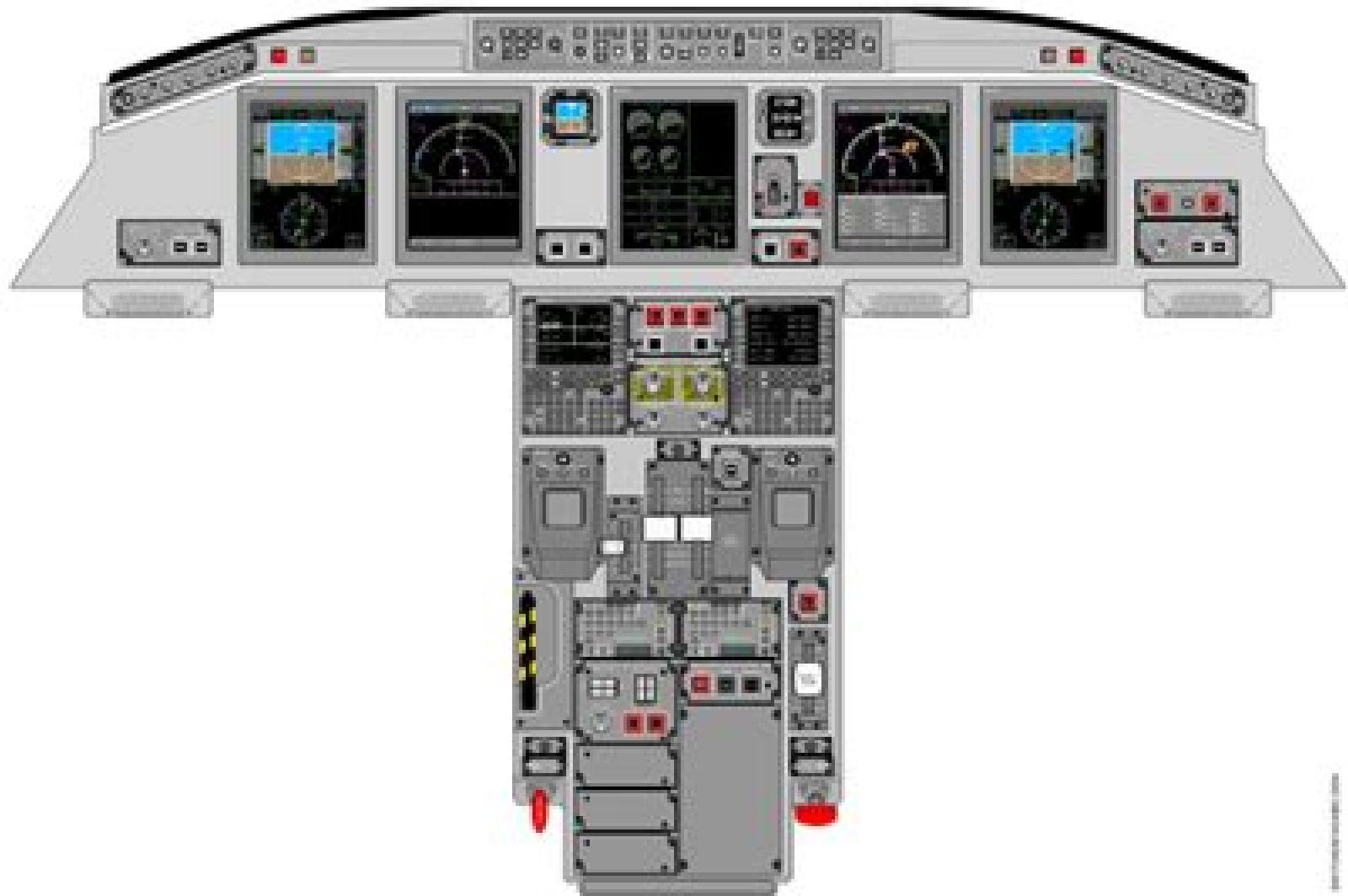
MAIN/AREA SHIELD/CONTROL PEDESTAL PANELS