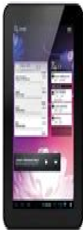
Gematic - GEM66 Quick Start Guide