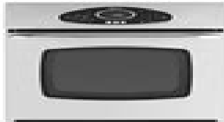
Stainless Steel Single Oven MEW5527DDS / MEW5530DDS