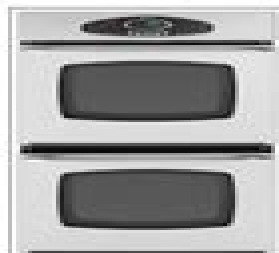
Stainless Steel Double Oven MEW5627DDS / MEW5630DDS