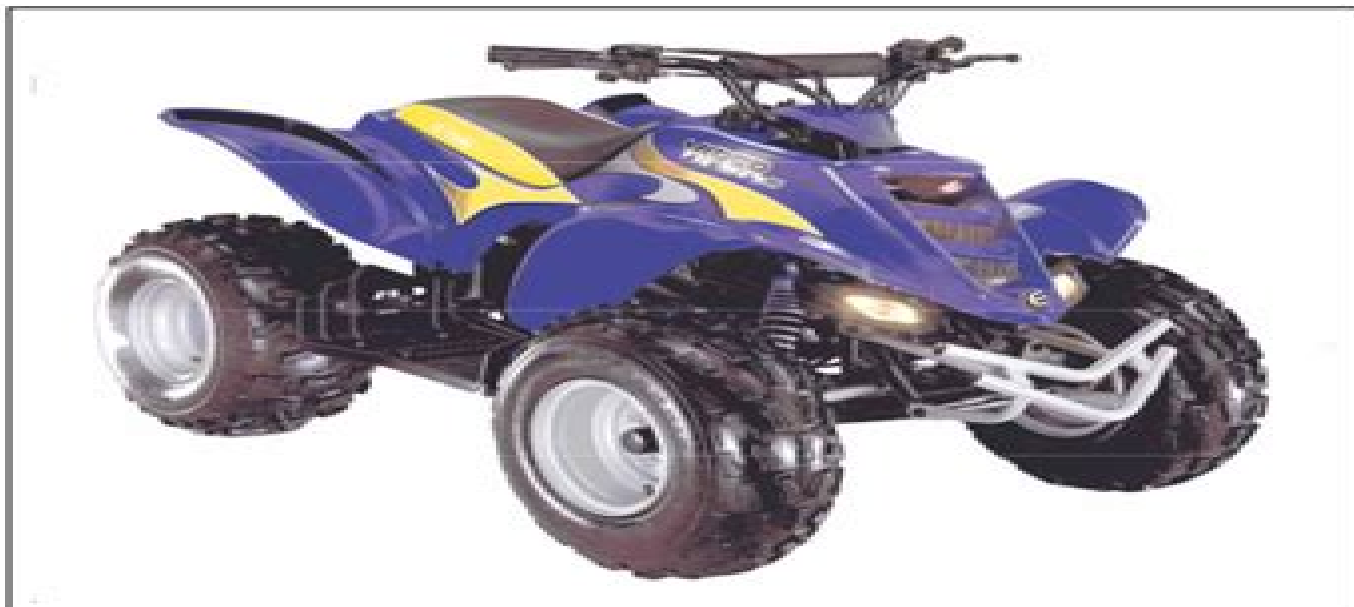
Viper 50M, Viper 70, Viper 90 and Viper 90R