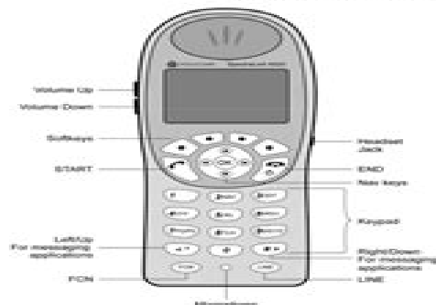
SpectraLink 6020 Wireless Telephone