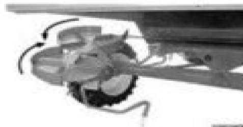
Rotation direction of disks and deflector sheets position for vertical position