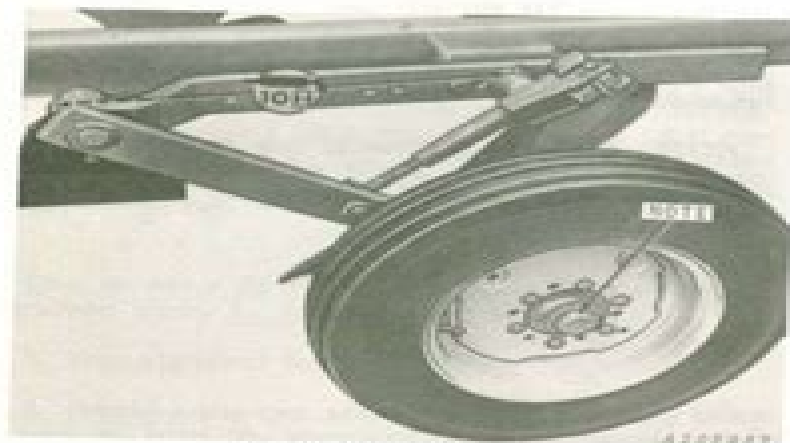
Gauge Wheel Attachment (Special Equipment)

NOTE: Repack wheel bearings every one-hundred hours with wheel bearing grease.