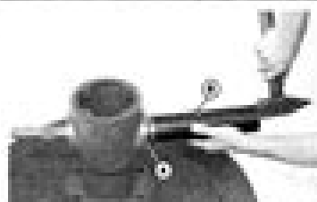
Illustration Number: 40-10-10