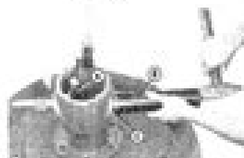
Illustration Number: 40-10-10