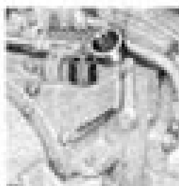
Figure 18-4-3—Adjusting the oil level in the filter housing