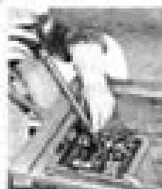
Figure 18-4-6—Checking Battery Specific Gravity

If liquid level is too low to check, add distilled water. It will take 10 to 15 minutes for the water and electrolyte to mix.