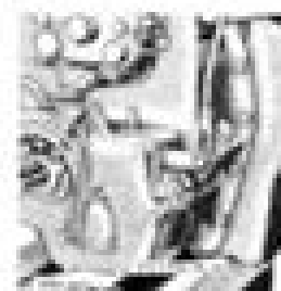
Figure 18-4-9—Power Shaft Clutch Housing Filler Plug

If the tractor is equipped with an engine drive "box" power shaft, check the oil level in the shaft by inserting the filler plug (Figure 18-4-9). Oil level should be up to level of bottom thread in filler opening. If it is not, add good clean SAE 10 W oil until its level is correct.