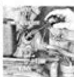
Figure 18-4-4—Adjusting the oil level in the fuel tank

If oil level is low in either engine, add sufficient good, clean oil to bring the level up to the "full" mark on the dip stick.